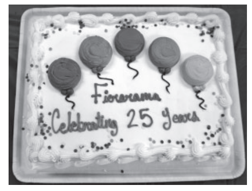
The 25th celebration festivities continued with dessert after pizza with a delicious sheet cake.

was recognized for having attended all twenty Fieroramas. With Fierorama 25,