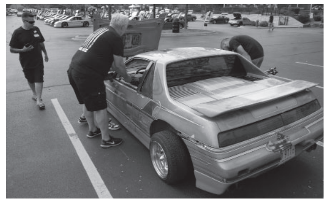
Special appearence of the soon to be restored 1990 Low Rider Magazine Fiero. Check out the Fierocast episode to hear about this unique car.

nity is that everyone has their own taste, and there isn't a great divide between keeping these cars original or modifying them. We all have respect for people's builds whether they want to modify them or restore them. We build what we want