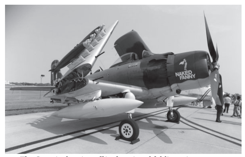
The Corsair showing off its functional folding wings.

History was made on Sunday, September 12, 2021, as NIFE hosted its 25<sup>th</sup> edition of Fierorama. Originally