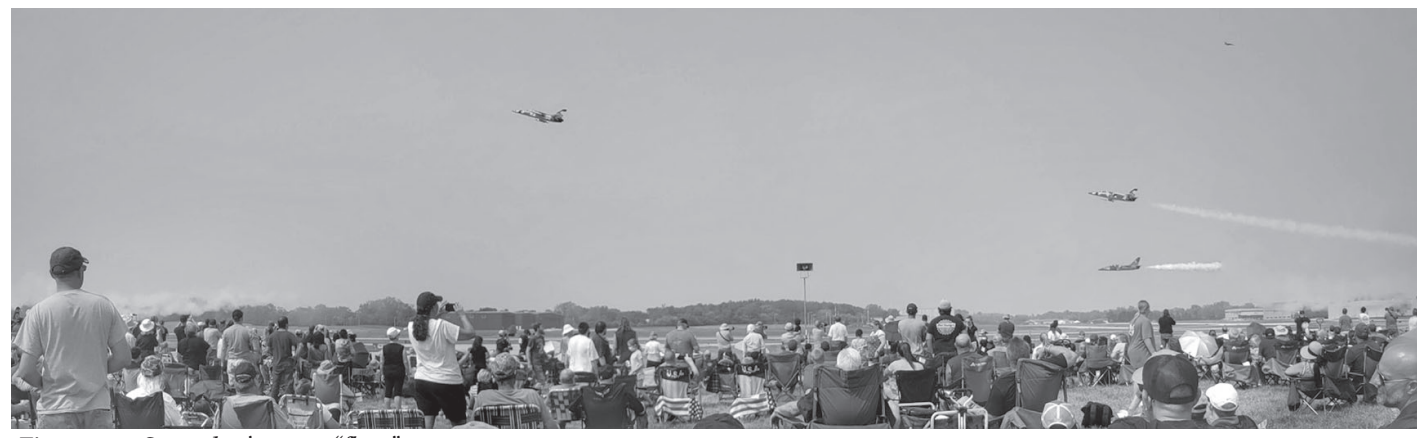
Fierorama Saturday's event "flew" us to the Waukegan Airport. It was a HOT day for an air show, but cloudless skies made for a perfect day as the planes soared high and low!

Not everything flew; there was a jetpowered fire truck built from a '40 Ford