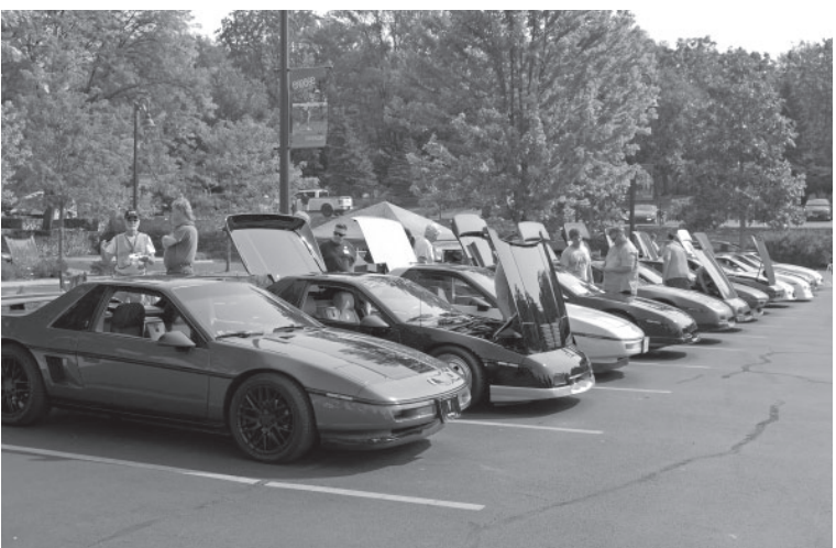
A small representation of the over 100 Fieros on the show field at Fierorama 25.