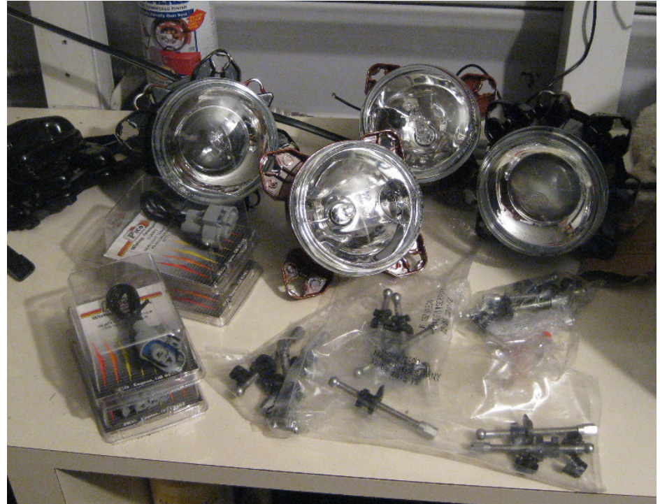
90 MM HEADLIGHTS