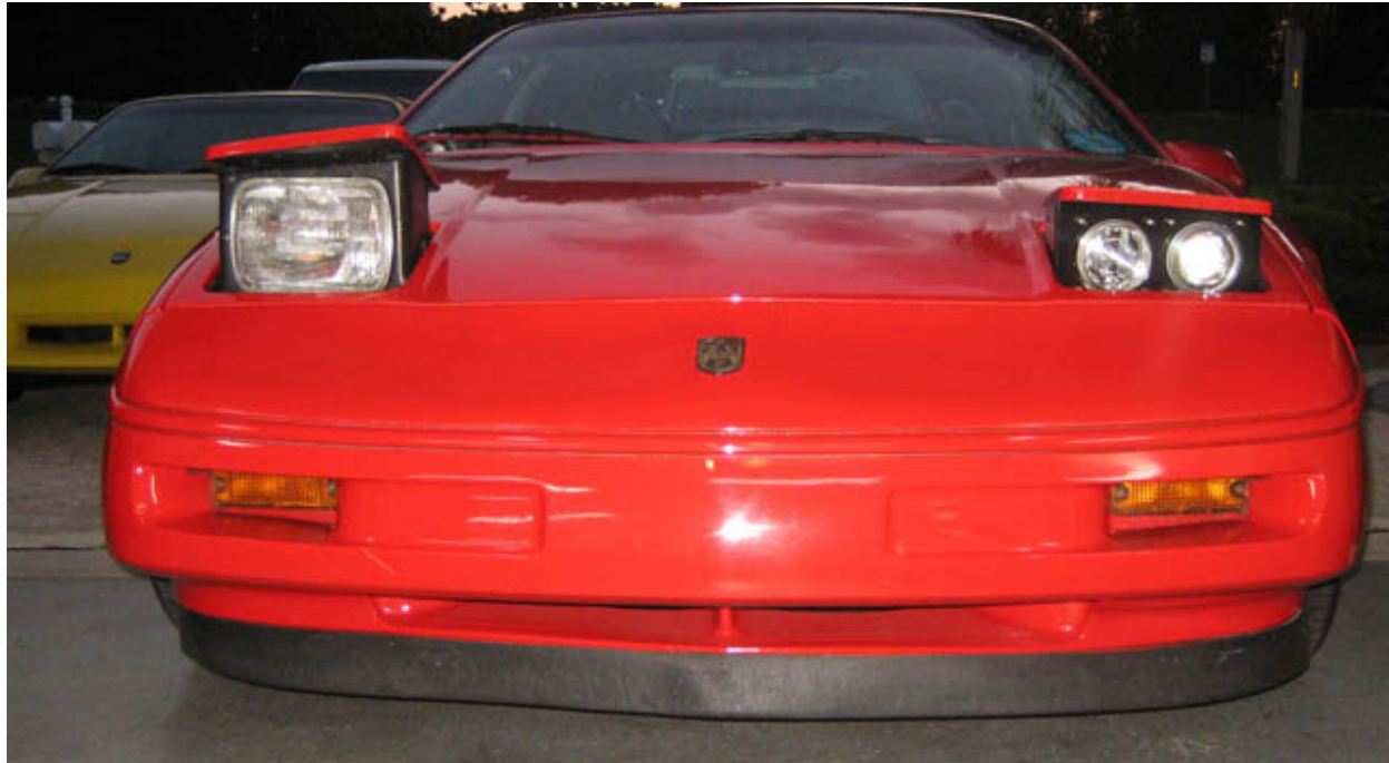
STOCK DELCO HEADLIGHT