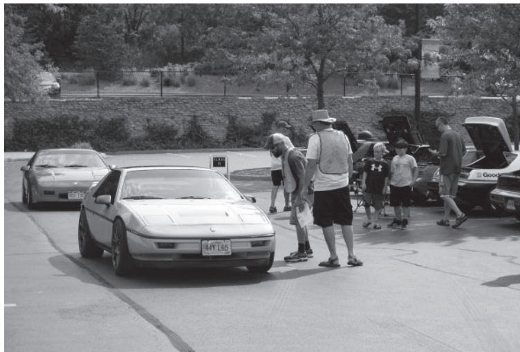
Fierorama parking lot volunteers performing their duties to ensure a wonderful presentation of the Pontiac Fiero for participants to enjoy.

I also enjoy catching up with old friends. I think it's been four or five years