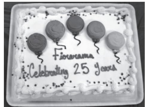
The 25th celebration festivities continued with dessert after pizza with a delicious sheet cake.