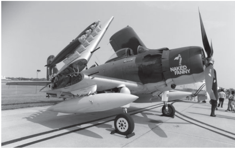
The Corsair showing off its functional folding wings.