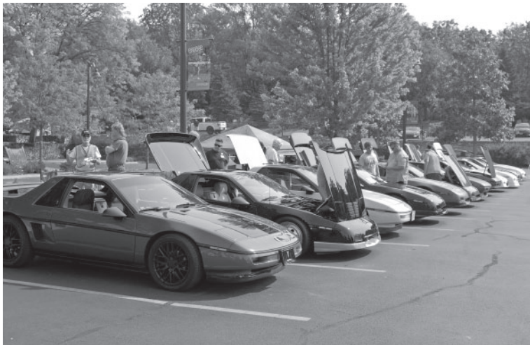
A small representation of the over 100 Fieros on the show field at Fierorama 25.

since I last attended a Fierorama, and a few people came up to me and started talking as if we last spoke a week prior. That has less to do with Fierorama than the nature of the greater Fiero community,