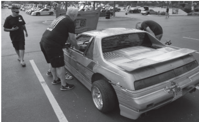
Special appearance of the soon to be restored 1990 Low Rider Magazine Fiero. Check out the Fierocast episode to hear about this unique car.

nity is that everyone has their own taste, and there isn't a great divide between keeping these cars original or modifying them. We all have respect for people's builds whether they want to modify them or restore them. We build what we want