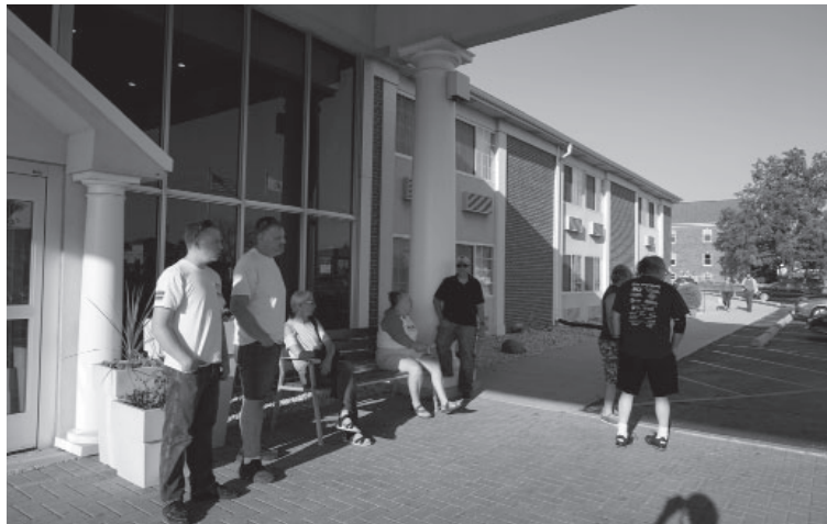
Awaiting departure as we soar to new heights! Fierorama Friday finally arrived as we await the 5:30pm lift off to head to our first event of Fierorama 25!

Finally, 7:00am rolled around. I sent the kids off to school and gave my wife a